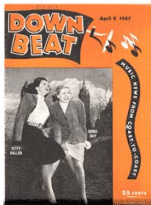
"Spring maids," Kitty Kallen and Doris Day on the cover of Down Beat, v. 14, no. 8 (Apr. 9, 1947).