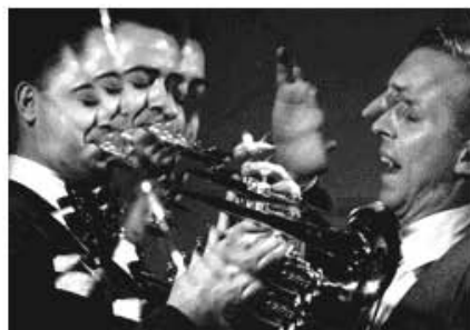
[The Finished Photograph]. (Music Division, LC-GLB13-0485)

Sometimes Gottlieb employed what he called "gimmicks," or attention-getting devices, in his photographs. For example, he might take an in-camera double exposure or use symbolic imagery. In his "foggy" portrait of Mel Tormé , who earned the appellation the "The Velvet Fog" because of his soft yet husky voice, Gottlieb shows the singer vocalizing while surrounded by dry-ice clouds. On this particular assignment, Gottlieb went backstage to interview Tormé, and after a brief greeting, the vocalist headed for the shower, giving Gottlieb time to consider the type of portrait he should take. He went out to a delicatessen for some dry ice. Back in the dressing room, he put the ice in the sink, and when Tormé finally came out of the shower and dressed, Gottlieb asked him to sing beside the sink as water running over the ice created clouds. To eliminate any distracting details, Gottlieb pulled a sheet from the cot in the room and draped it on the wall behind the sink.