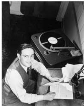
[Gottlieb, Washington, D.C., ca. 1940]